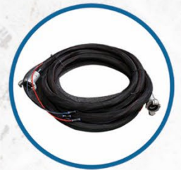
Blast Hose Extension

Use this 40° angled nozzle for hard to reach areas