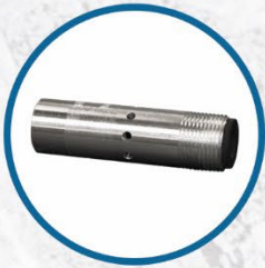
Double Venturi Nozzle