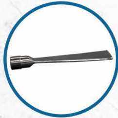
Stainless Steel Fan Nozzle

Wide, uniform pattern ensures gentle cleaning with high production rates. (For soft media use only)